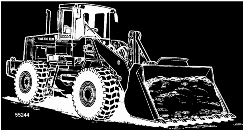
Figure 1 Loader L150

The steering system is hydrostatic with a variable load-sensing axial piston pump and two hydraulic cylinders (steering cylinders). Hydraulic system, see [Invalid linktarget].